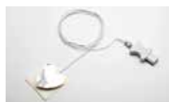
Skin Temperature Sensor