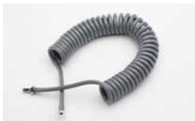
NIBP Tubing, Coiled