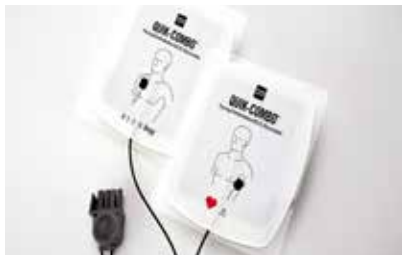
EDGE System Electrodes with QUIK-COMBO Connector

18-month minimum shelf life remaining at time of shipment from Physio-Control except where noted.