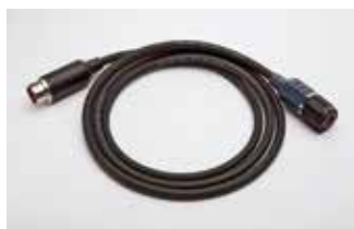
Extension Cable for AC/DC Power Adapter 11140-000080