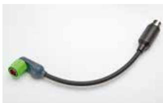
Replacement Right Angle Power Cable for AC/DC Power Adapter 11140-000081