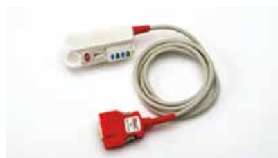
Pediatric Rainbow Direct Connect Reusable Sensor

11996-000335 (3ft) 11171-000032 (8ft) 11996-000336 (12ft)