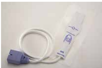
Oxisensor II (24/box) Adult 11996-000113 (18 in. - Ref# D25) 11996-000114 (36 in. - Ref# D25L) Pediatric 11996-000116 (18 in. - Ref# D20)