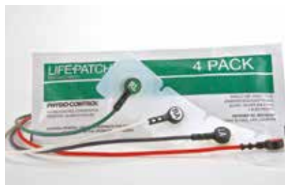
LIFE-PATCH ECG Electrodes Adult, pregelled. 11100-000002 (4/pk)