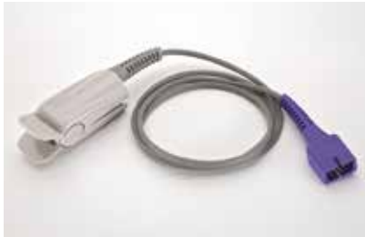
DURASENSOR Reusable Clip 11996-000060 (Adult - Ref# DS100A)