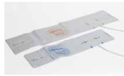
Single Patient Use Cuff