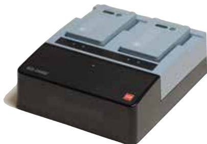
REDI-CHARGE Base AC power cord and adapter tray not included. 11141-000115