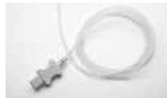
Esophageal-Rectal Temperature Sensor