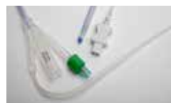
Foley Catheter Temperature Sensor

11996-000361 (14FR, 10/PK) 11996-000362 (16FR, 10/pk) 11996-000363 (18FR, 10/pk)