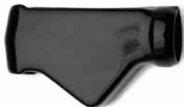
Reusable Ambient Light Shield