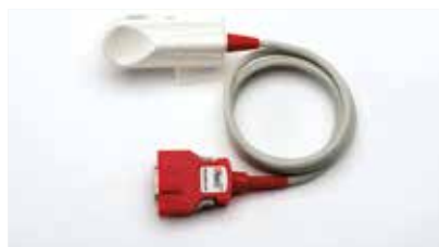
Adult Rainbow Direct Connect Reusable Sensor

11996-000335 (3ft) 11171-000032 (8ft) 11996-000336 (12ft)