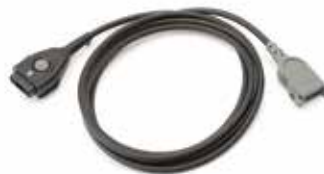
QUIK-COMBO Therapy Cable

For use only with manual monitor/defibrillators; 12 month minimum shelf life at time of shipment 24 in. leadwire length. 11996-000093