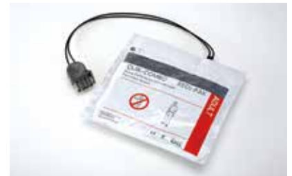
EDGE System Electrodes with QUIK-COMBO Connector and REDI-PAK™ Preconnect System