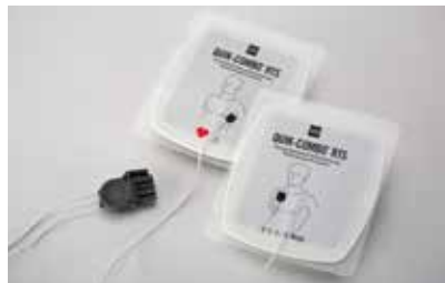
EDGE System RTS (Radiotransparent) Electrodes with QUIK-COMBO Connector