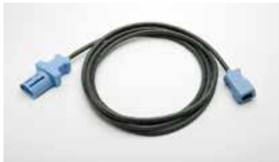
Temperature Adapter Cable