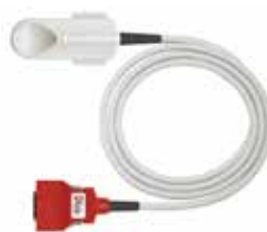
Pediatric Reusable Direct Connect Sensor