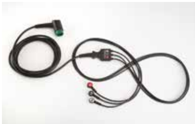
3-Wire ECG Cable Right-angle connector 11110-000029