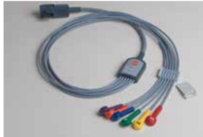
12-Lead ECG Cable 6-Wire Precordial Attachment 11111-000022