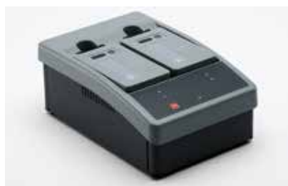
Mobile Battery Charger Includes AC and DC power cords, mounting bracket and operating instructions. 11577-000011