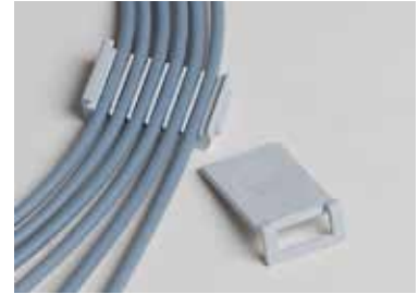
4-wire Cable Comb 21300-008054 (10/pk)