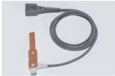
Oxiband Reusable Sensor Includes 50 disposable adhesive sensors 11996-000061 (Ad/Neo - Ref# OXI A/N) 11996-000062 (Ped/Inf - Ref# OXI P/I)