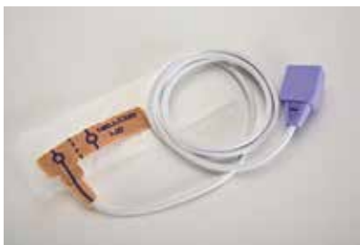
Oxisensor II (24/box) Infant 11996-000115 (18 in. - Ref# I20) Neonatal/Adult 11996-000117 (18 in. - Ref# N25)