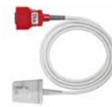
Adult Reusable Soft Direct Connect Sensor