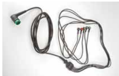
5-Wire ECG Cable Right-angle connector, 4-wire limb plus one chest lead, labeled "V1" on the LIFEPAK 15 monitor reports. 11110-000066