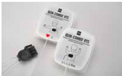
Pediatric EDGE System RTS Electrodes with QUIK-COMBO Connector

For use only with manual monitor/defibrillators; 12 month minimum shelf life at time of shipment 24 in. leadwire length. 11996-000093