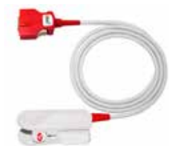
Adult Reusable Direct Connect Sensor