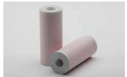
Box of Strip Chart Recorder Paper 100mm x 22m 11240-000016 (2 rolls/box)