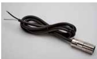
Replacement DC Input Cable 11140-000084