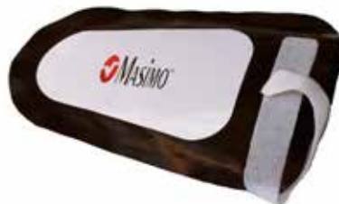
Disposable Ambient Light Shield