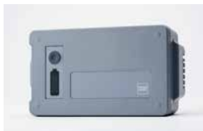
Lithium-ion Battery 5.7 Ah 5.7 amp hour, 11.1 volt, rechargeable, with fuel gauge. 21330-001176