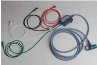
12-Lead ECG Cable Trunk Cable with 4-Wire Limb Leads 11111-000018 (5ft) 11111-000020 (8ft)