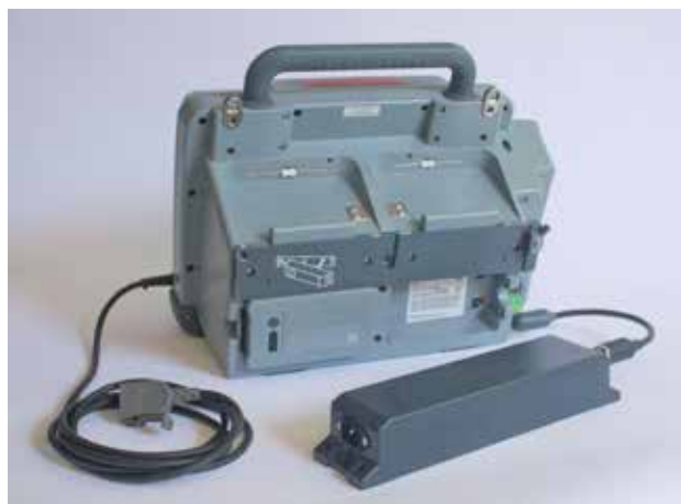
AC Power Adapter Includes Right Angle Cable (AC power cord not included) 11140-000072